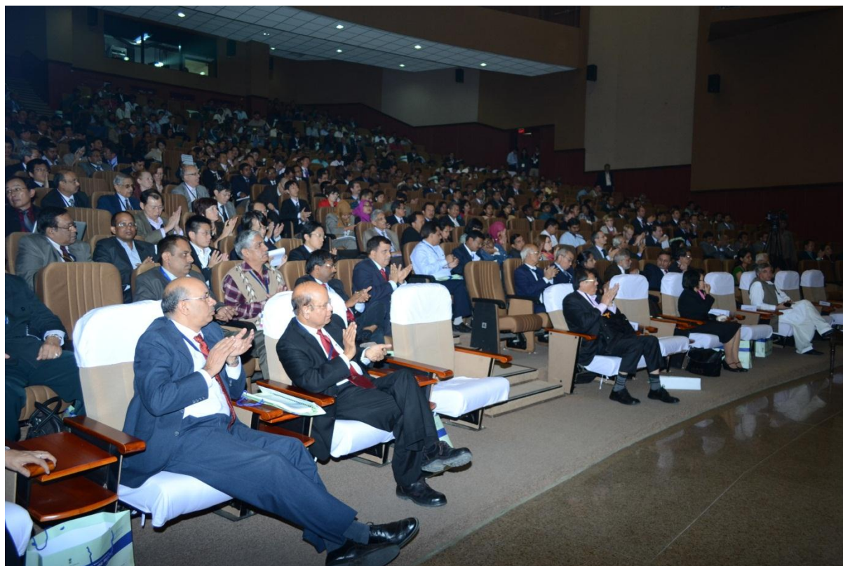
Gathering at UMI technical sessions 2011