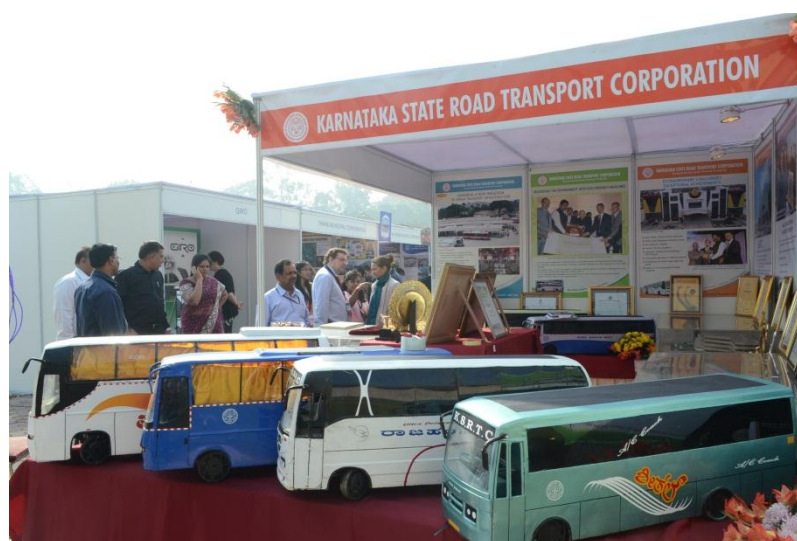
A stall exhibiting Public Transport by KSRTC