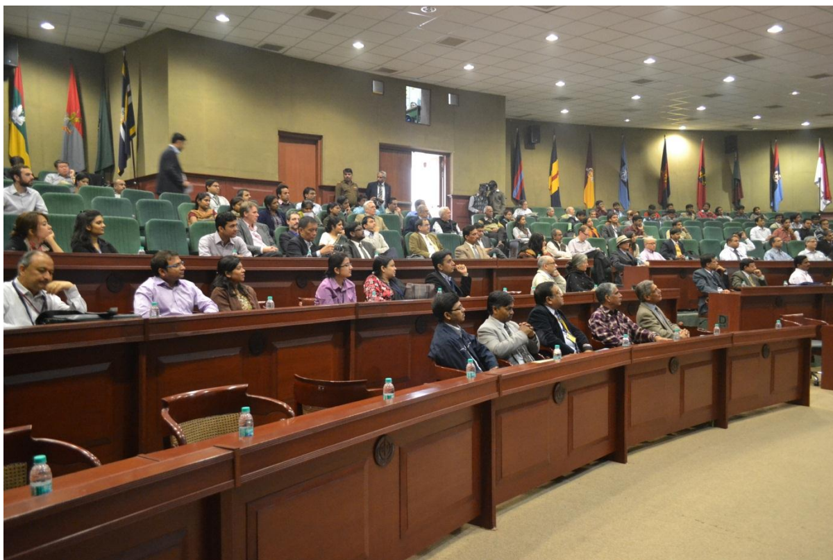
Gathering at Joint Plenary Sessions