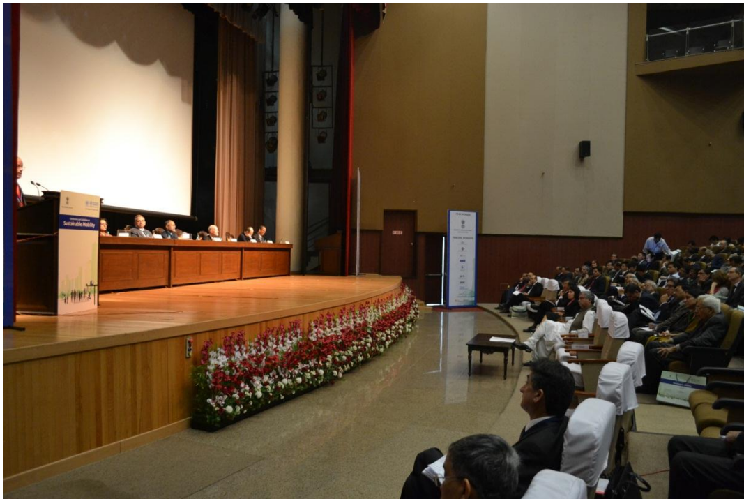
Gathering at EST in UMI 2011

The Conference cum Exhibition on Sustainable Mobility held from 3rd to 6th December 2011 at New Delhi, India, included the Urban Mobility India (UMI) Conference 2011 and the Sixth Regional Environmentally Sustainable Transport (EST) Forum in Asia. The annually held Regional EST Forum in Asia, which is the key component of the Asian EST Initiative, provides a strategic and knowledge platform for sharing experiences and disseminating best practices, policy instruments, tools, and technologies among Asian countries in relation to various key aspects of EST underlined in the Aichi Statement (2005). Currently covering twenty- three Asian countries, the high-level policy Forum aims at not only promoting an integrated approach to deal with a range of social, economic, and environmental issues in the transport sector, but also in fostering interagency coordination as well as facilitating partnerships and collaboration between governments and international organizations such as development banks, bilateral and multilateral donors.