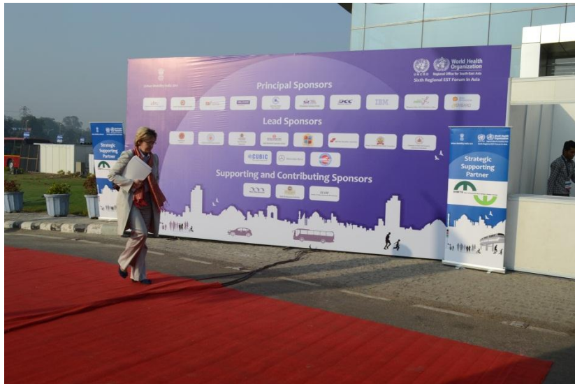
Key Sponsors of UMI 2011