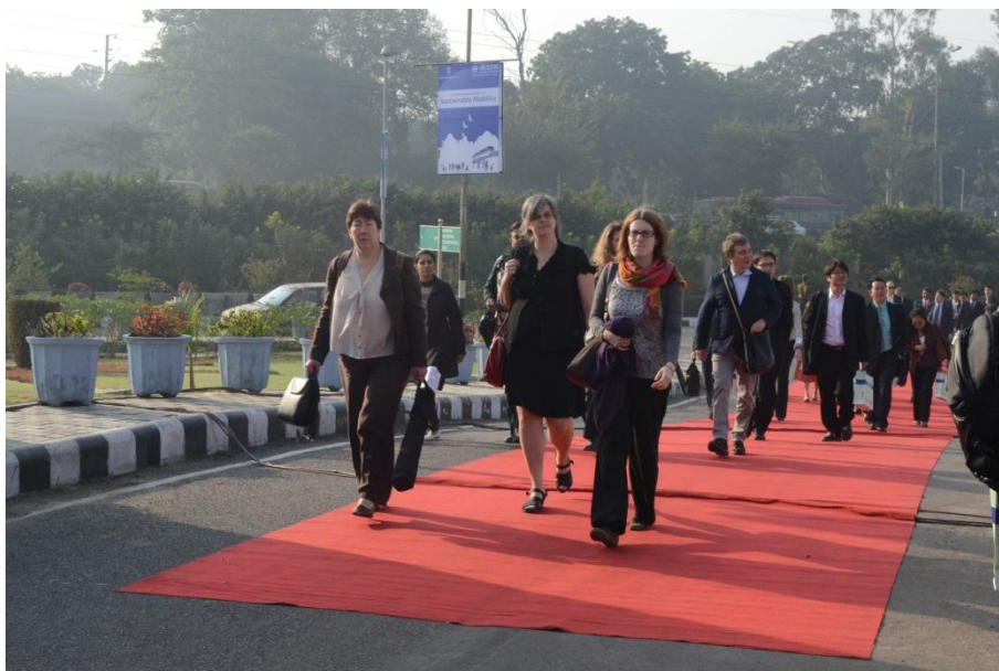
The delegates entering the venue of UMI 2011 at Maneshaw Centre, New Delhi