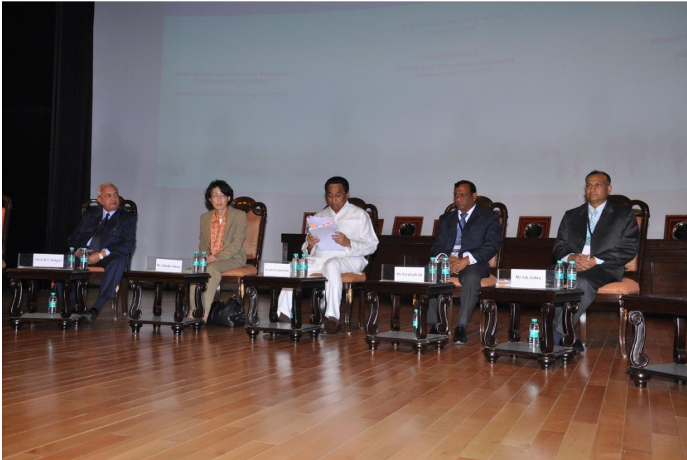
Shri Kamal Nath, Minister of Urban Development, GoI

3-6 December 2011; Manekshaw Centre, DhaulaKuan, New Delhi, India