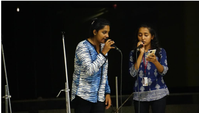
The music band by St.Teresa’s college students for the UMI’s Curtain Raiser at Vyttila Metro Station.