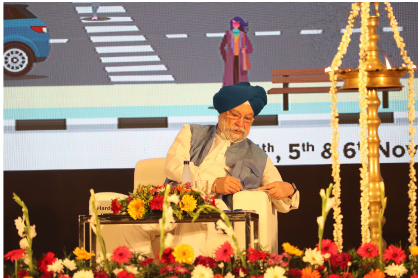
Union Minister Hardeep Singh Puri during the inaugural ceremony.