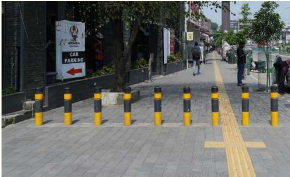
Inter locking tiles for easy replacement and maintenance instead of cement paste tiles