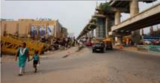
No pedestrian crossing