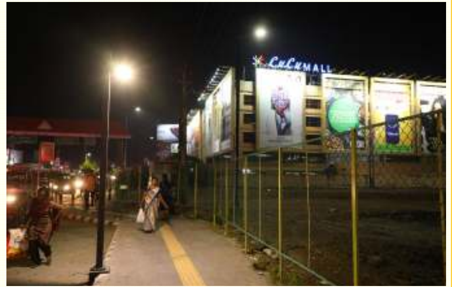
Ample footpath lighting