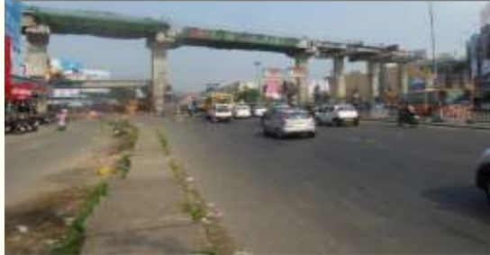
Improper drainage system