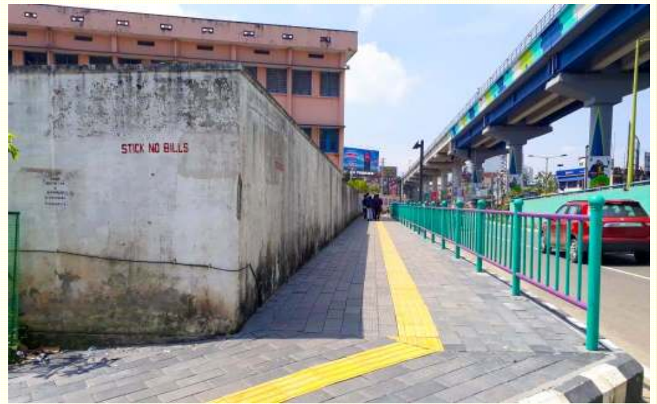
Handrails for pedestrian safety