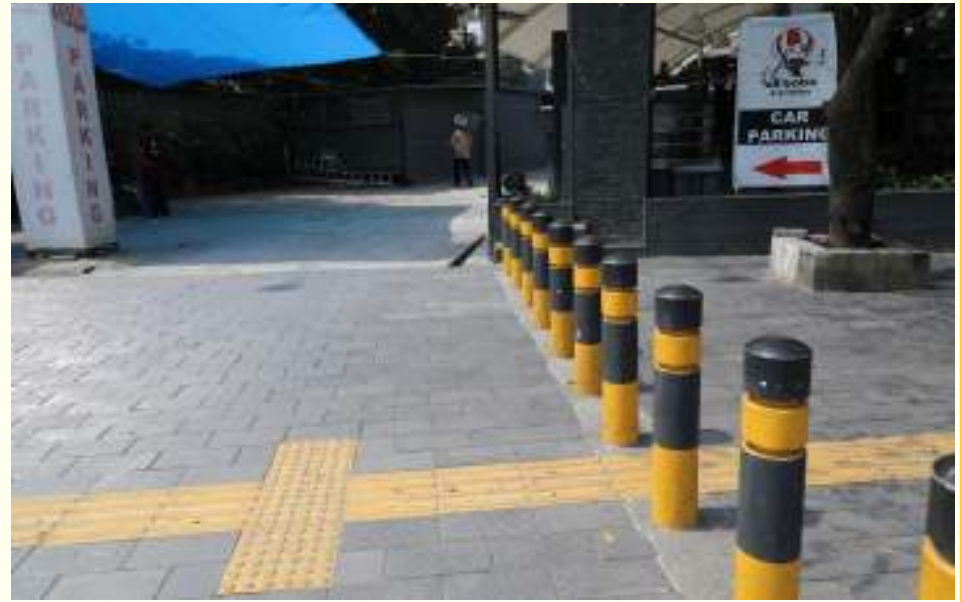
Bollards for blocking vehicle movement/parking on footpath