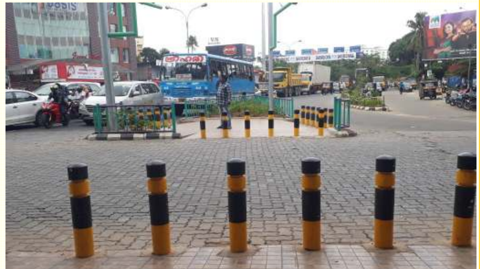
Easing for pedestrian crossing from traffic Islands