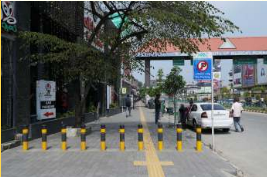
Even footpath for the entire stretch