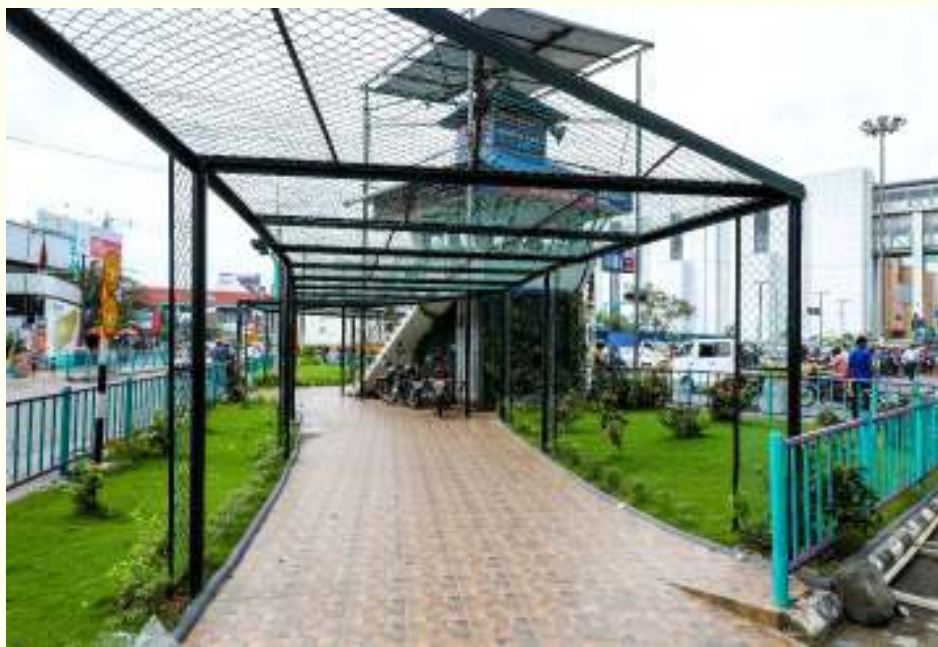
Shaded pedestrian crossing