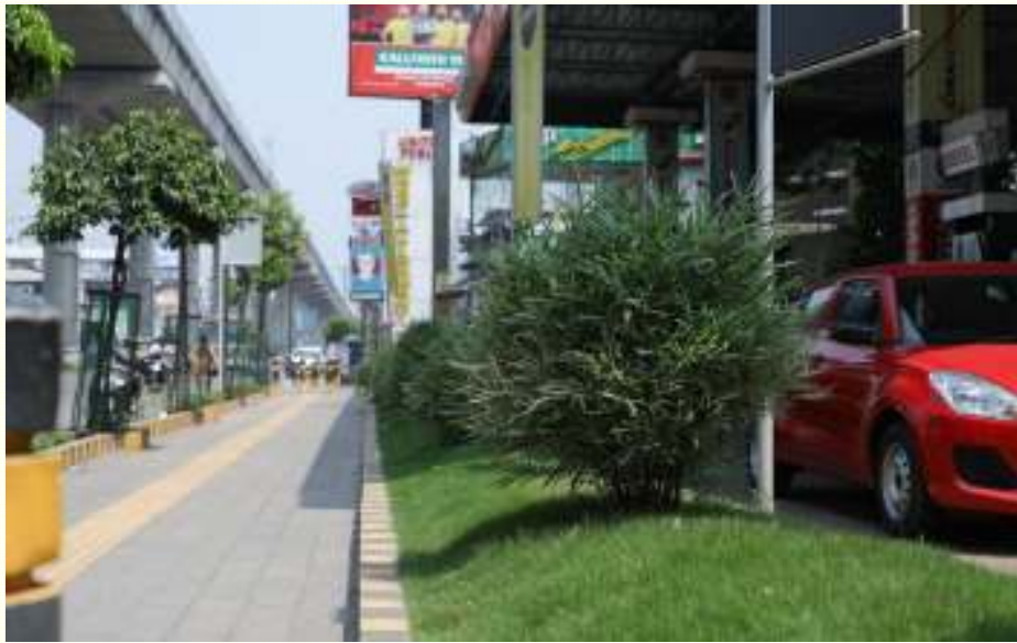
Hustle free footpaths