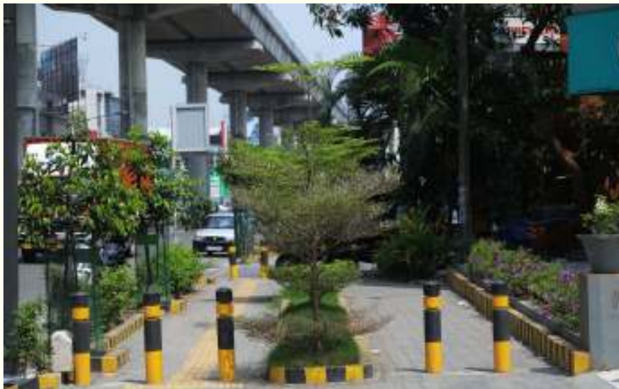
Greening with Trees and plants