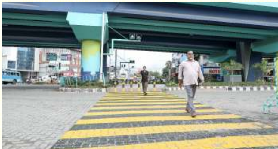
Signalling system and safe pedestrian crossings