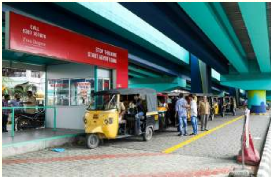
Dedicated prepaid auto stand