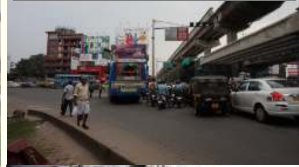
Lack of footpath