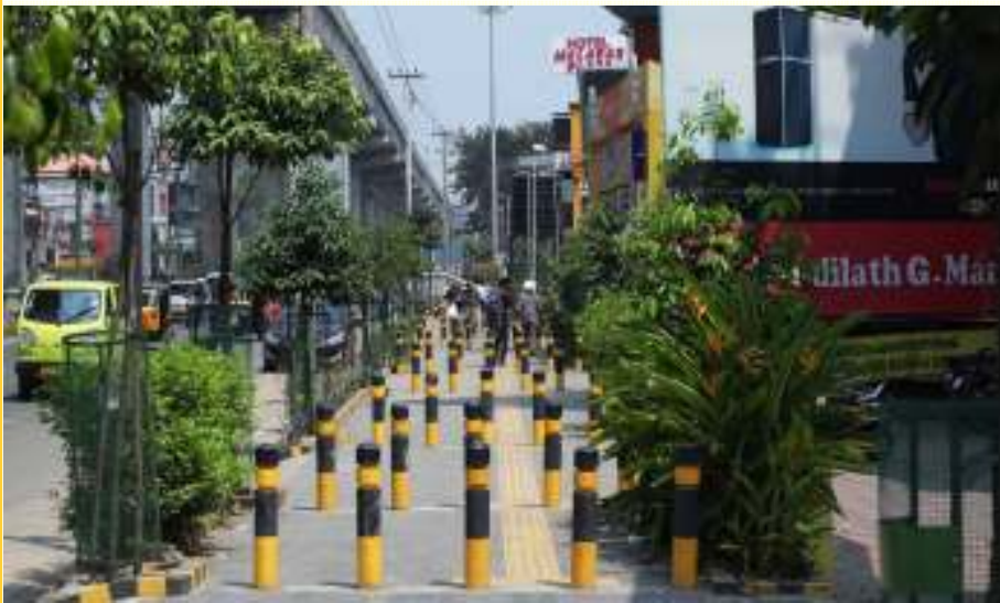
Footpath width not less than standard width