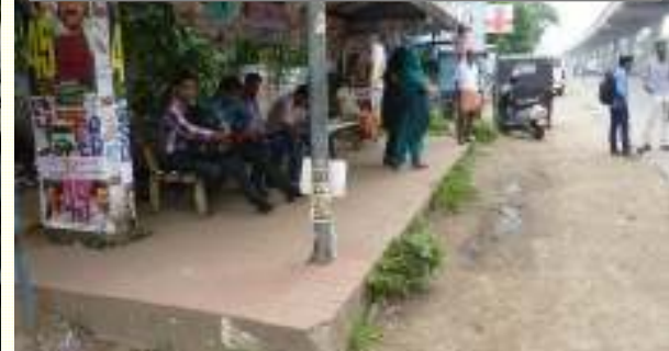
Lack of defined bus bays