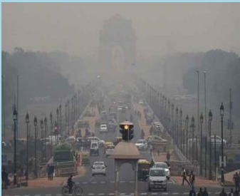
INCREASING AIR POLLUTION