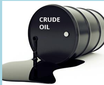
INCREASING OIL IMPORT